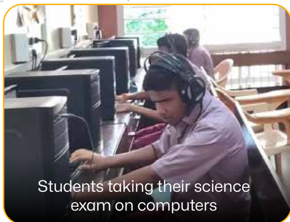
Students taking their science exam on computers

Our residential School for the Blind offers free education, lodging and boarding to currently 80 boys from grade 1 to 10 following the State Board Syllabus (Marathi Medium).