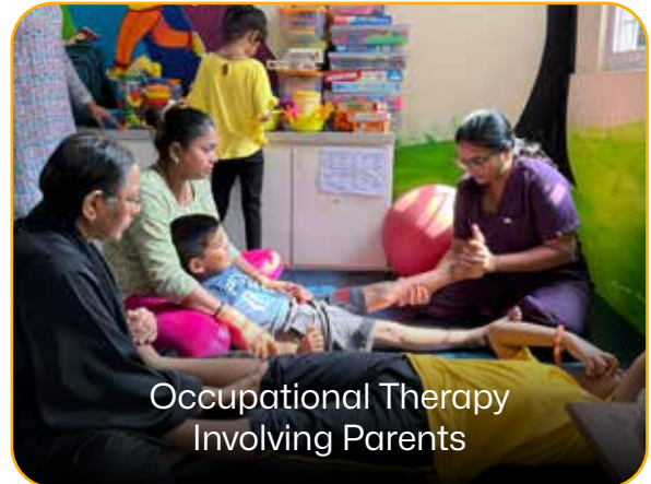
Occupational Therapy Involving Parents

VMS - Vijay Merchant Centre empowers children with special needs through various therapies and life skills training to help them grow into emotionally secure, socially confident individuals. The Centre is open to any individual with special learning needs. In addition to our professional therapy sessions, we also empower parents with the training and tools they need to continue therapy with their child at home.