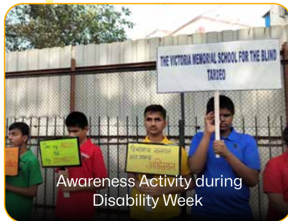
Awareness Activity during Disability Week