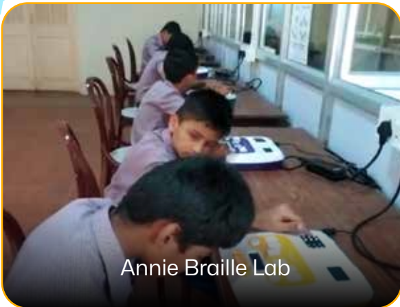
Annie Braille Lab

Annie Braille is a special device that helps Blind children learn to read and type in Braille on their own.