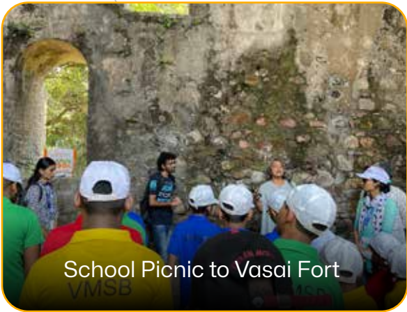
School Picnic to Vasai Fort