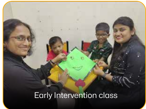
Early Intervention class

Early Intervention classes for students under 6 years with developmental delays focus on preparatory skills, covering functional development, daily living activities, communication and basic academic concepts.