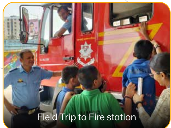
Field Trip to Fire station