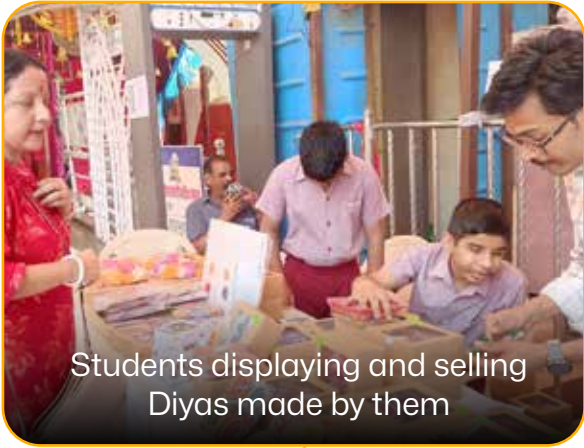
Students displaying and selling Diyas made by them